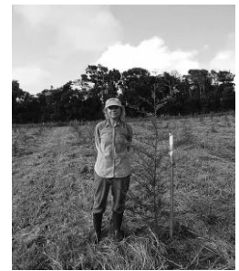
One year old redwoods FNQ trial