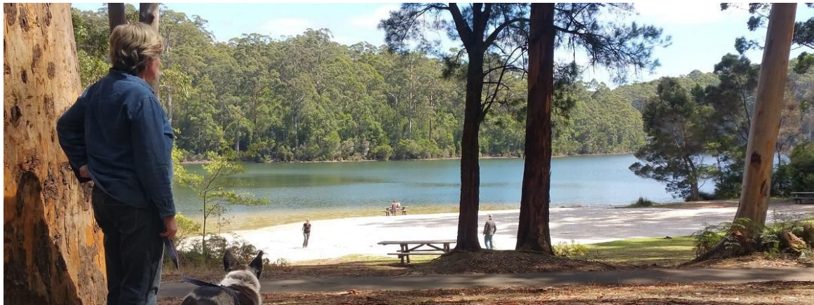
Big Brook Dam